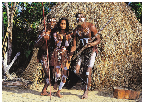
Aboriginal peoples lived in Australia before the arrival of Europeans.

the lifestyle of the indigenous people and many became sick from new illnesses and died.